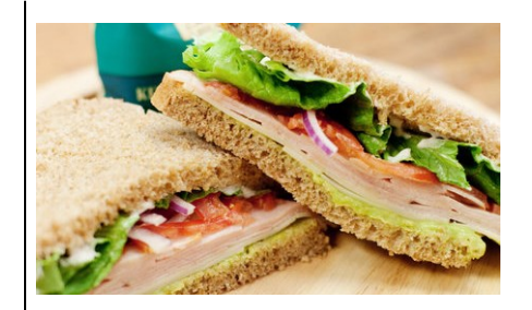
Cold Cut Sandwiches