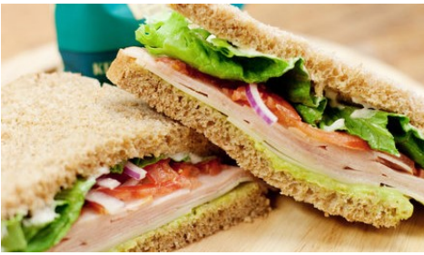
Cold Cut Sandwiches